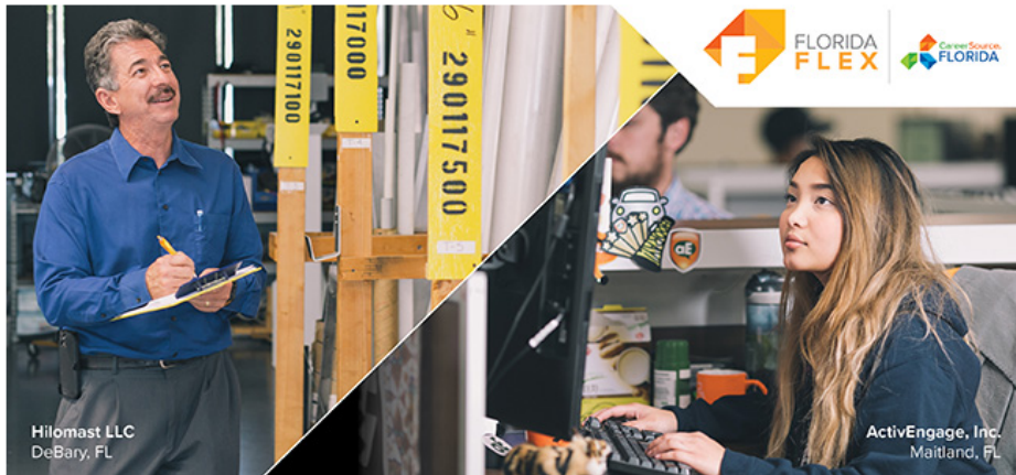
Hilomast LLC DeBary, FL